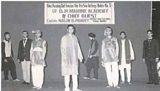
A still from the Fashion Show presented by the cadets

"I would rate most of the BP Marine ratings as comparable or may be better than some of the officers of the Merchant Navy."