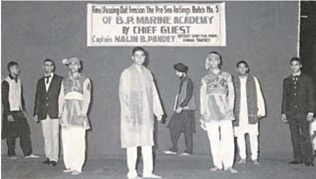
A still from the Fashion Show presented by the cadets

"I would rate most of the BP Marine ratings as comparable or may be better than some of the officers of the Merchant Navy."